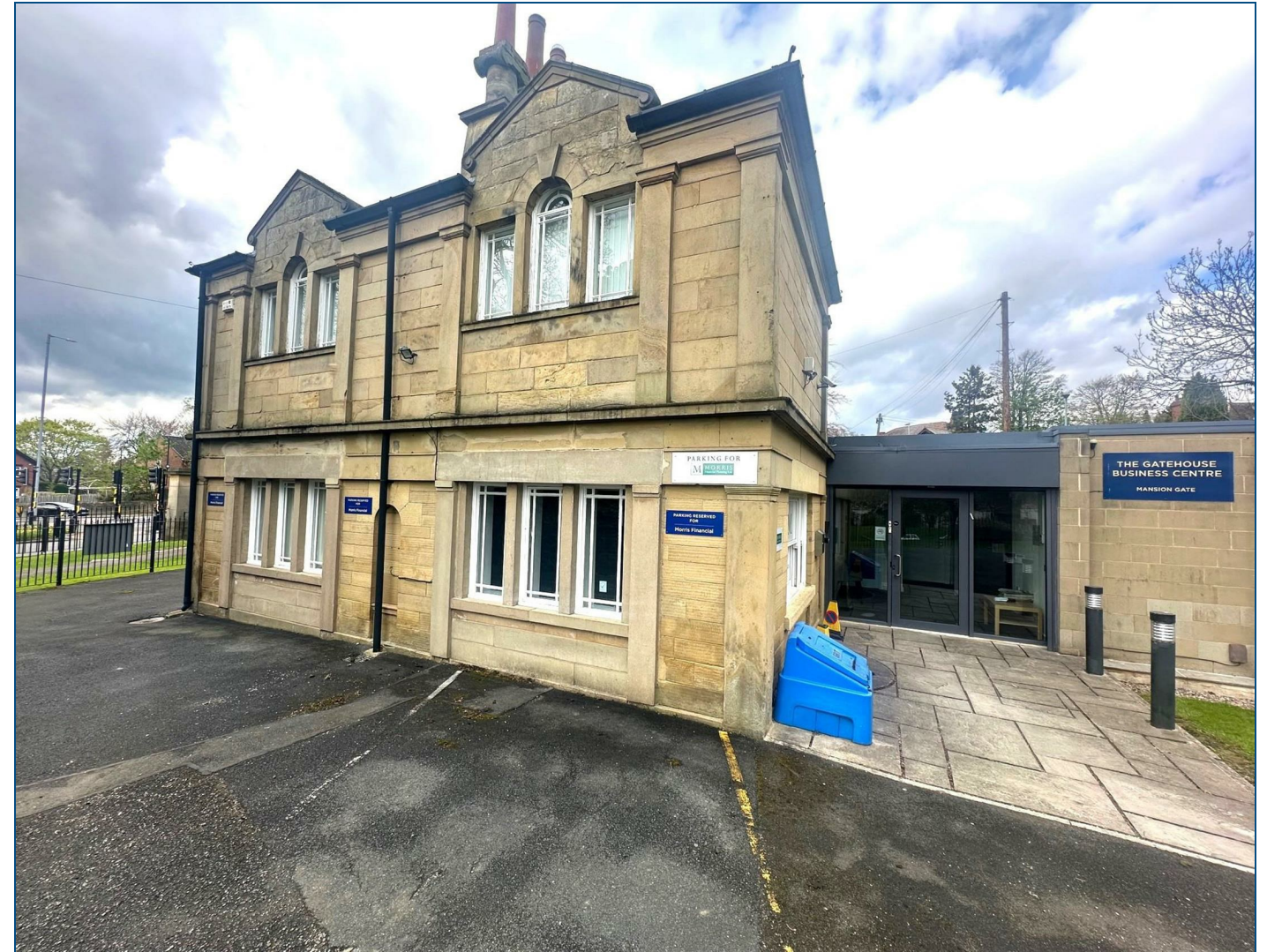
Gatehouse Business Cnt, Chapel Allerton, LS7 4RF £15,950 Per Annum